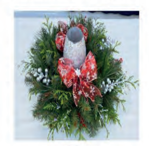
Let It Snow