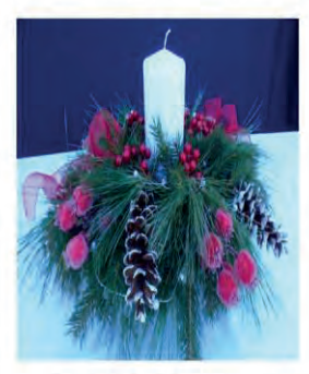
Festive Pedestal Centerpiece