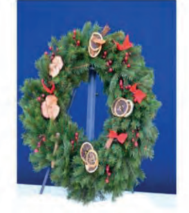
Colonial Williamsburg Wreath

Donation $45.00 per selection – Limited Reservations Registration begins November 1st – Final date for registration November 20th To Register, email mrsnation46@gmail.com or phone 908-359-6317 Please give 1st & 2nd choices