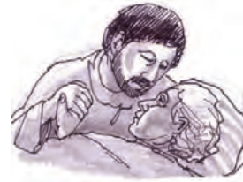
Jesus Heals Peter's Mother-in-Law