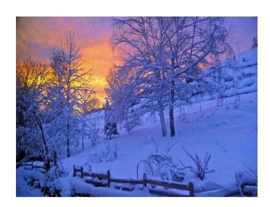
This Moment in Prayer, Service and Community