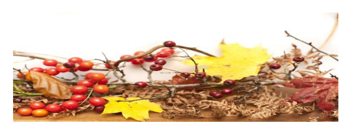
Dear All - Christ's Peace!

Enhanced Precautions , Sections 3 and 4 the two center sections. Sit in EVERY THIRD and wear masks. Please save the seats along the back walls for people who have mobility issues.