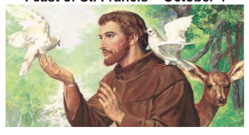
Feast of St. Francis - October 4