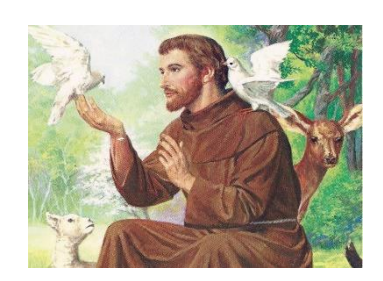
Dear All - Christ's Peace!

Enhanced Precautions , Sections 3 and 4 the two center sections. Sit in EVERY THIRD and wear masks. Please save the seats along the back walls for people who have mobility issues.