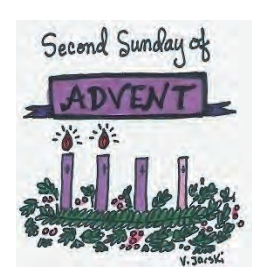
Dear All, Christ's peace!